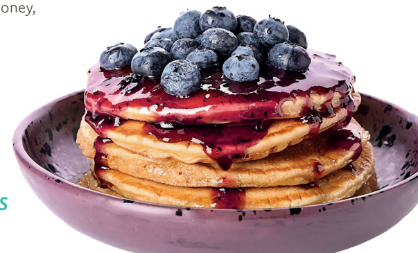
BERRY NUTELLA PANCAKES

Yoghurt, granola, strawberry, blueberry, honey, pistachio.