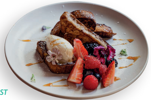
CINNAMON FRENCH TOAST

Bacon, Chorizo, Mixed bell peppers, Cherry tomato, Mushrooms, Spinach, Mozzarella cheese, Feta cheese, Fried onion