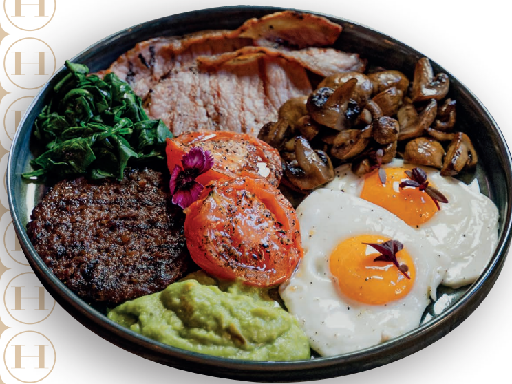
BIG KETO BREAKFAST